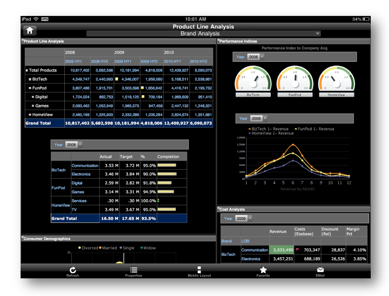
Figure 4: Oracle Exalytics delivers interactive visual analysis to Apple iPad and iPhone.